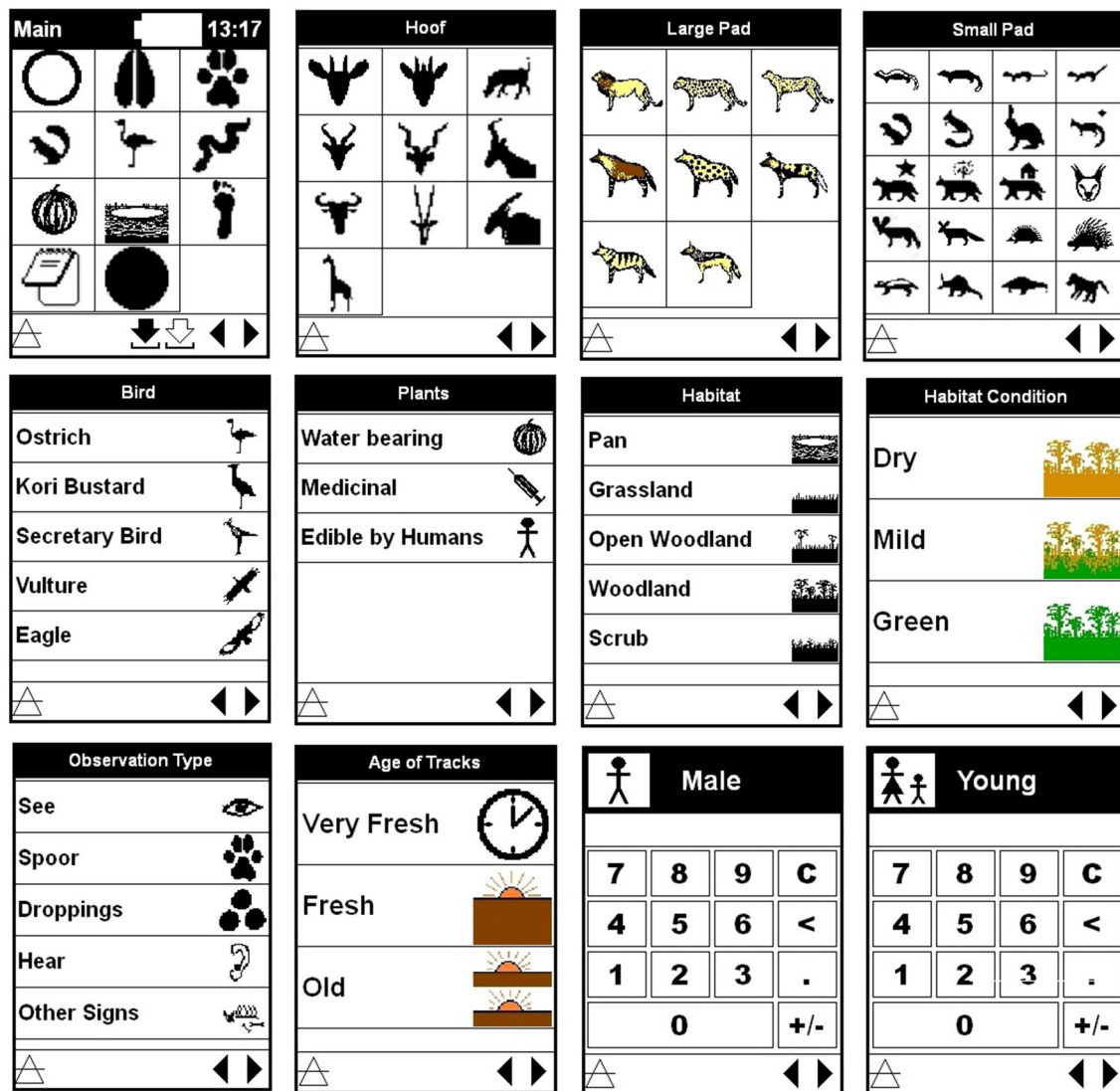
Fig. 2. Examples of Icon User Interface designs.